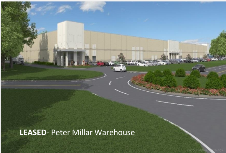
LEASED- Peter Millar Warehouse