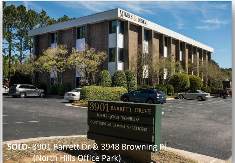
SOLD- 3901 Barrett Dr & 3948 Browning Pl (North Hills Office Park)